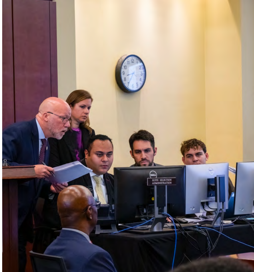
AOC team members carefully preside over the office lottery process, ensuring each available office space is reflected in the pool.